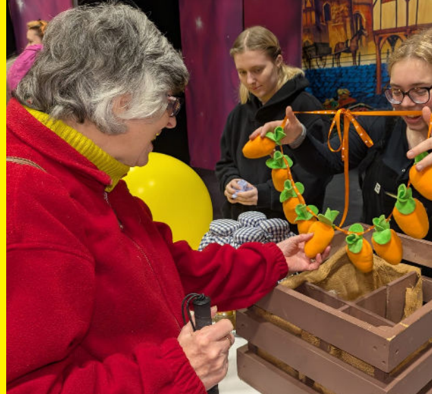
A woman from the Didcot group feeling props and a pantomime.