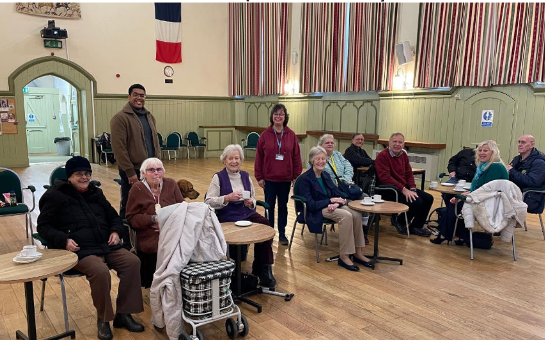
The Faringdon Group before watching an Audio Described Film