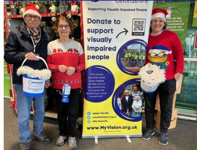
Three of our volunteers at the ASDA bucket collection.