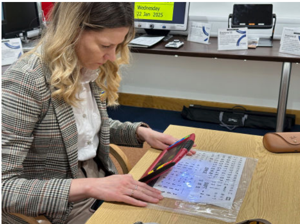
One of the Ukrainians learning to use a digital magnifier

We shared insights into our services, including technology training, social groups, and counseling. The delegates experienced firsthand assistive technologies used by our clients.