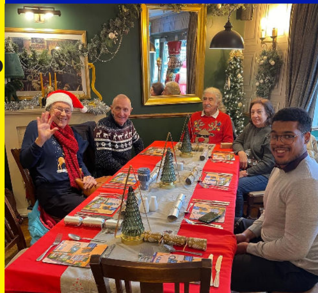
The Thame Group meeting up for their Christmas lunch. They are sitting around a table, waiting for food with Christmas Crackers

For more information on our Social Groups, visit our website, or contact us at Info@MyVision.org.uk