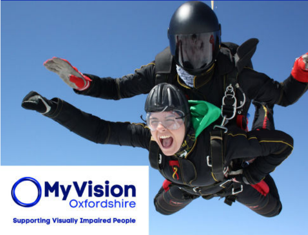
A photo of two people skydiving. The MyVision logo is on the left hand side.