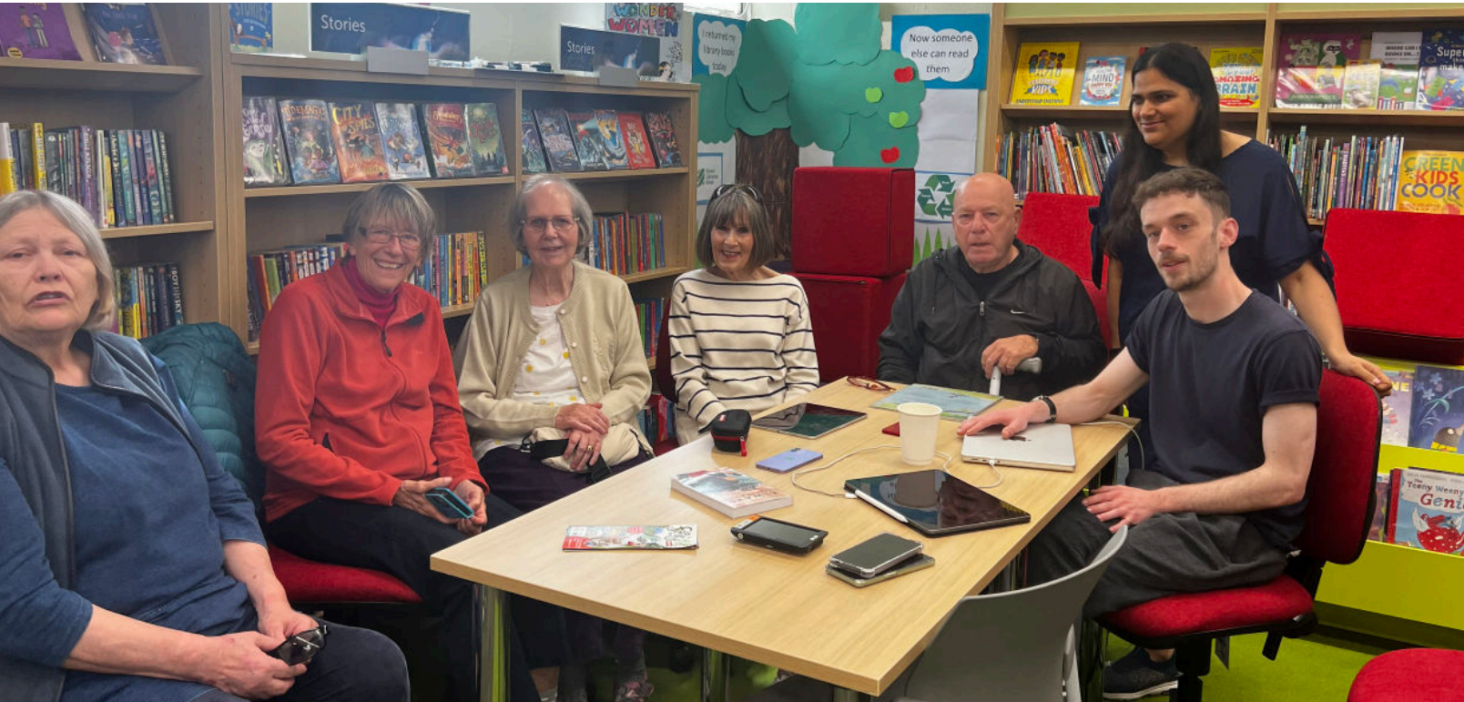
A photo from the Chipping Norton Get Connected workshop. There are seven people sitting around a table.

Personalised clinics will remain a cornerstone for those who want to delve deeper into a particular device, troubleshoot unique issues, or keep pace with software updates.