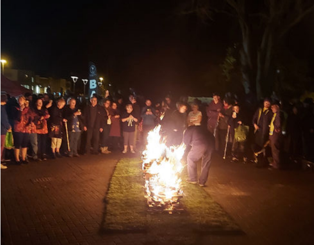
A photo from last years Firewalk. There is a large group of people standing around the fire.

If you have an idea of your own, or you'd like to get involved another way, let us know and we can help you get your plans off the ground! Contact Fundraising@MyVision.org.uk .