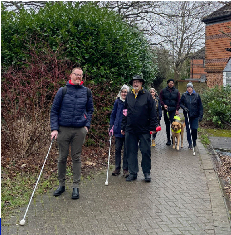
A photo from our first ever Green Walk in Didcot, 23rd January 2024. There is a group of people walking on a path.

January 23rd marked the one year anniversary of our first Green Walk! Over the past year, we’ve enjoyed exploring the county together, and the company of like minded people. We’re incredibly grateful to everyone who has joined us on these walks and made them such a success. Keep an eye on the events calendar for upcoming Green Walk dates and join us for another year of outdoor adventures!