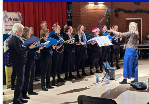
Vocalize Choir, one of the performers at the Christmas Concert.