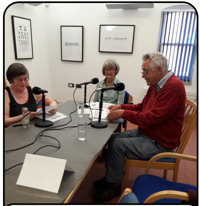
Oxtalk volunteers recording the weekly news

To contact Oxtalk email mail@oxtalk.org.uk or visit the website www.oxtalk.org.uk