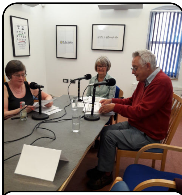
Oxtalk volunteers recording the weekly news

To contact Oxtalk email mail@oxtalk.org.uk or visit the website www.oxtalk.org.uk