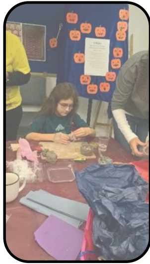
Having fun at the Ashmolean