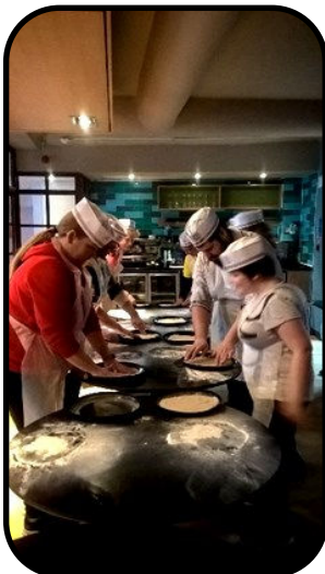
Making pizzas at Pizza Express