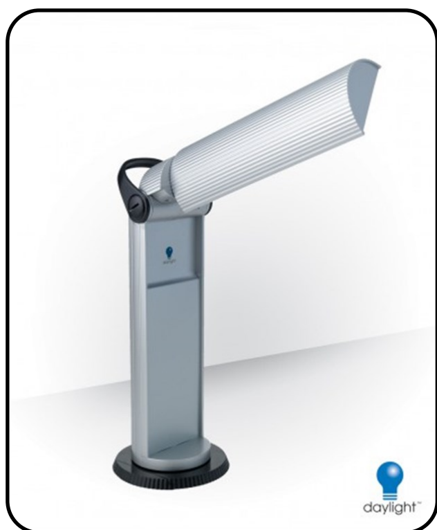
Image: Daylight twist portable lamp, call for more information.