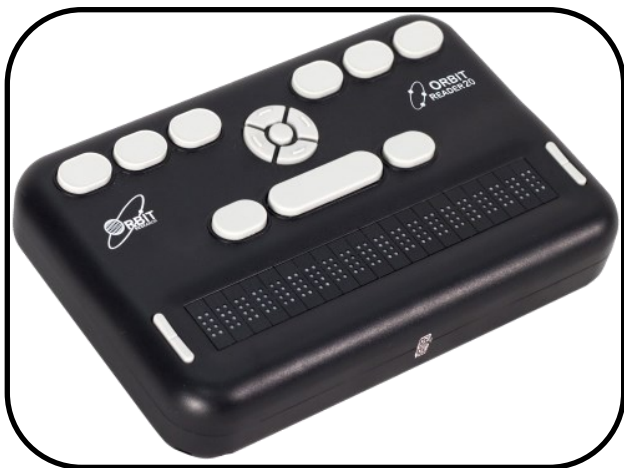
Image: Orbit 20 Braille Reader

If you are a braille reader and have ever accessed braille through a braille display you'll know that traditional braille displays can cost in excess of £2,000! The new Orbit 20 Braille Reader is an affordable 20 cell braille display that enables you to connect to your smartphone, tablet or PC, or access text or braille documents through an SD card. The display is portable, lightweight and well constructed and for £449 you'd be happy using this on the go! To find out more give us a call on 01865 725595 or go to www.rnib.org.uk/shop