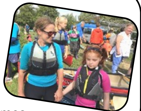
Kayaking along the River Thames