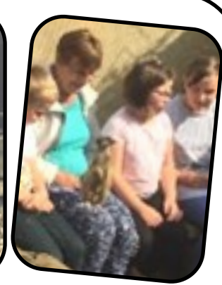
Goats, falcons and meerkats!