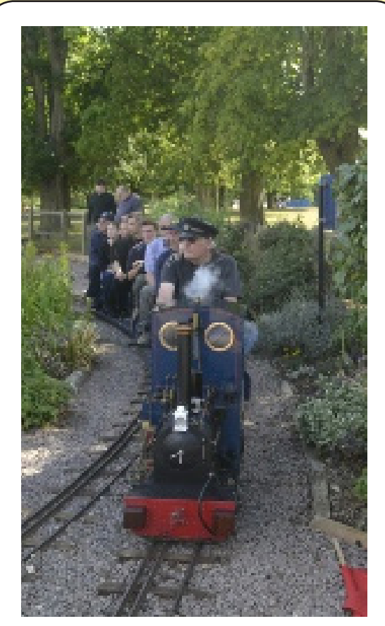
Full steam ahead in Cutteslowe Park

The miniature railway is operated by the City of Oxford Society of Model Engineers. Many of the volunteers who run it are skilled model engineers; they may spend years building the beautiful little locomotives that they run on the track in Cutteslowe Park.