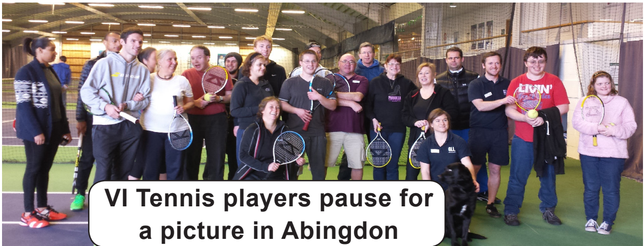
VI Tennis players pause for a picture in Abingdon

These are just a few of the activities experienced by our friends