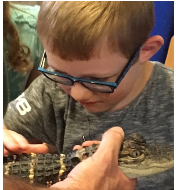
Crocodile world came to OAB

These are just a few of the activities experienced by our friends