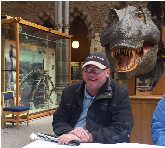
OAB went to the museum

Thanks to your donations and support, 2016 has been a great year