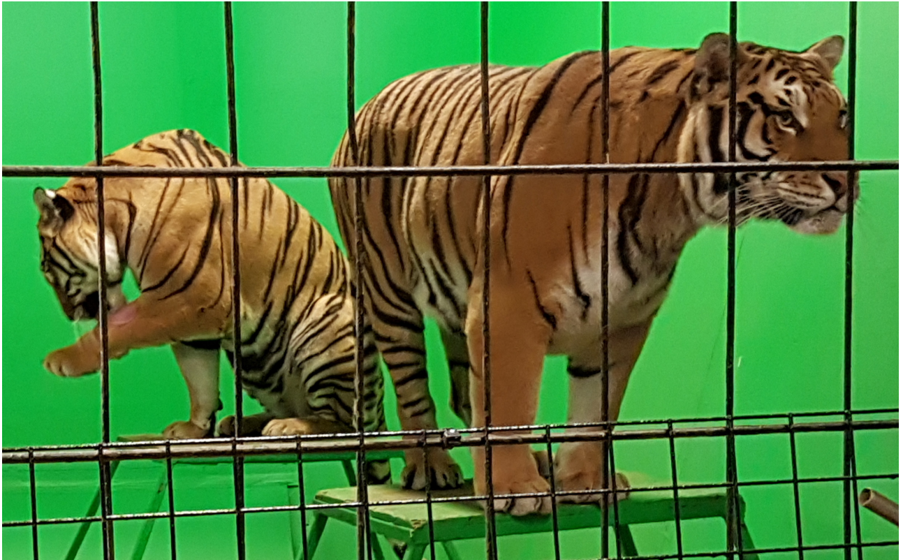
Two tigers perched on pedestals!

Over the summer ActiveEyes members visited both Heythrop Zoological Gardens and Cotswold Wildlife Park, as well as taking part in a bus event organised by RNIB and the usual tennis, cycling and social meetings.